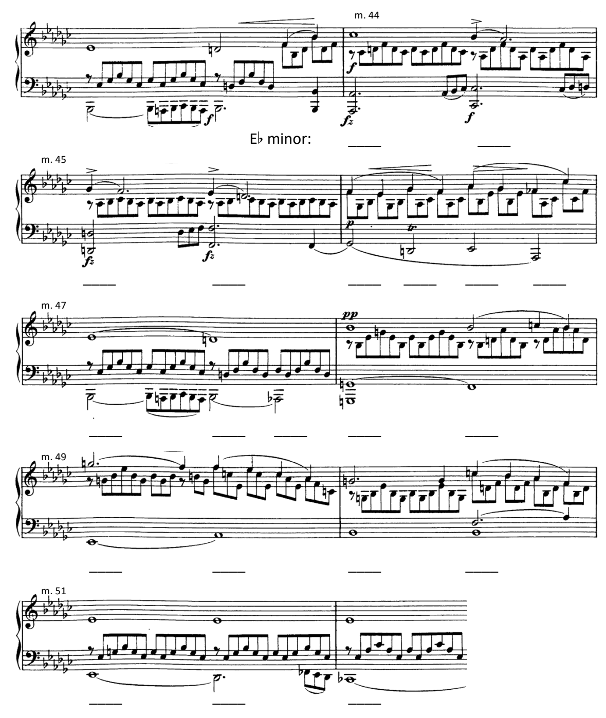
Worksheet example 42-2. Schubert, Impromptu in G-flat major, op. 90, no. 3, mm. 43-52