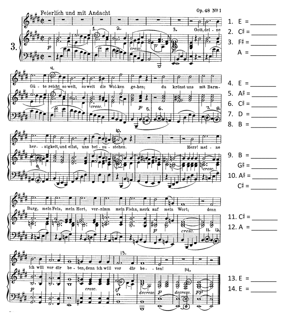
Worksheet example 29-3. Ludwig van Beethoven, op. 48, no. 1, "Bitten"

For Worksheet example 29-3, provide labels for each of the circled and numbered non-chord tones on the blanks provided. For each suspension, please note the specific type (9-8, 7-6, 4-3, or 2-3 suspension).